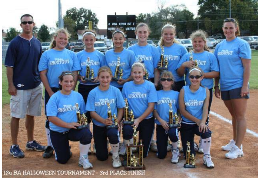
12u BA HALLOWEEN TOURNAMENT - 3rd PLACE FINISH