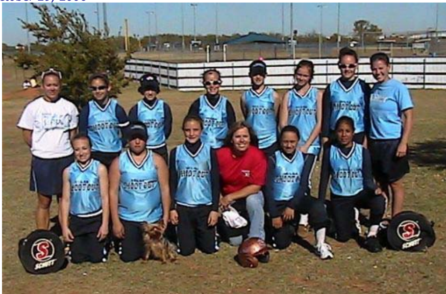
14's pictured with "Dr. Dot" Richardson, 3-time Olympic Gold Medallists